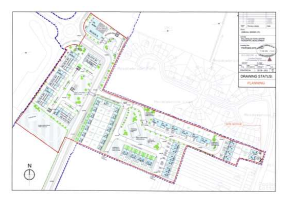
Layout of proposed development

In June 2020, Galway County Council invited Expressions of Interest for the provision of 'Turnkey' Housing via Notice to Developers/Building advertised in regional newspapers and via Galway County Council's website. Interested parties were requested to read the briefing document and to complete an EOI application form for turnkey developments, which was made available on GCC website. The closing date for receipt of EOI submissions was 20th August 2020 and following is summary of the initial stage 1 submissions: